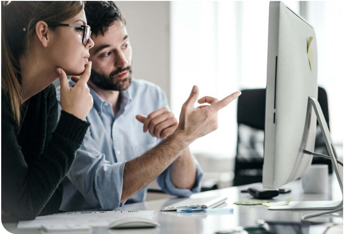
Background document 1.1