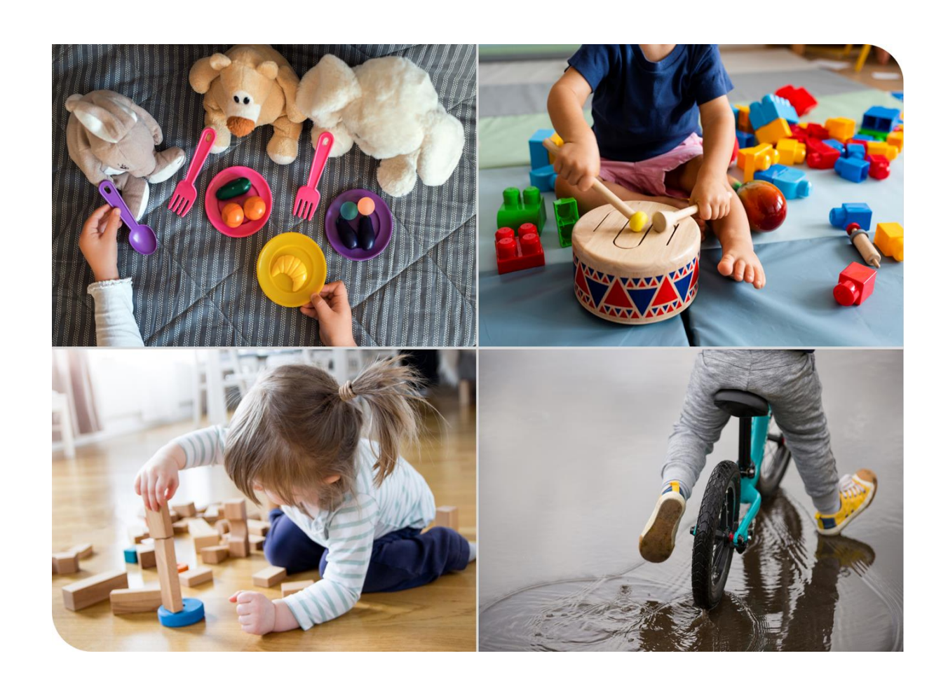
Version 3.8 • 18 June 2021 – 31 December 2026