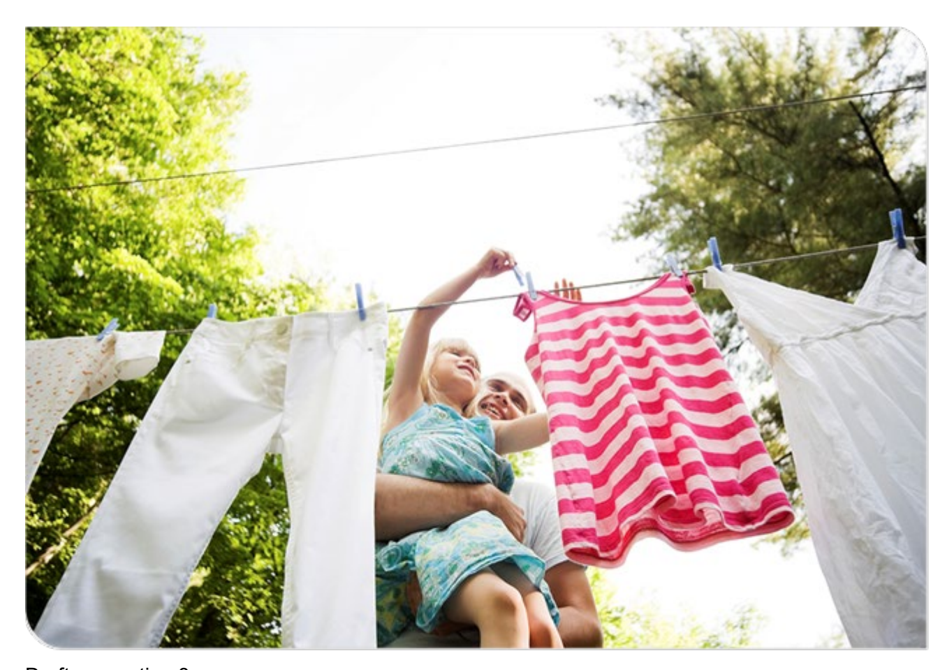
Draft generation 8