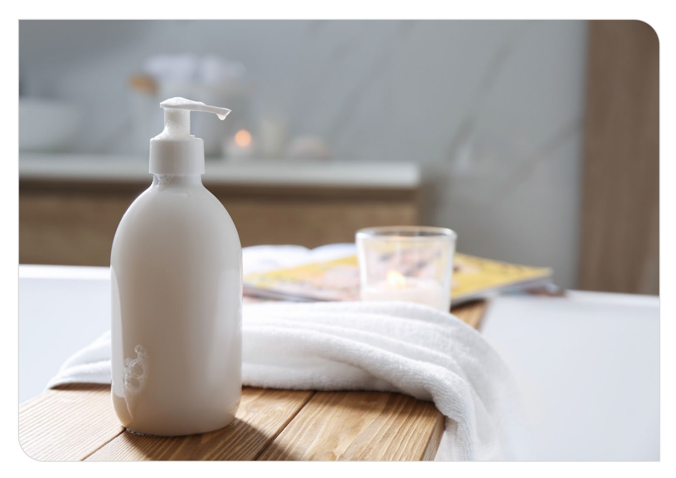
Version 4.3 • 04 November 2024 – 28 February 2030