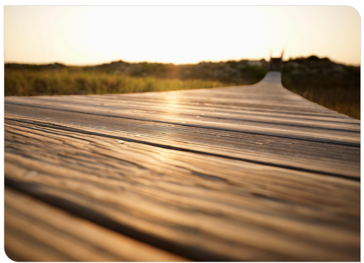
Version 3.0 • 07 March 2025 – 31 March 2030