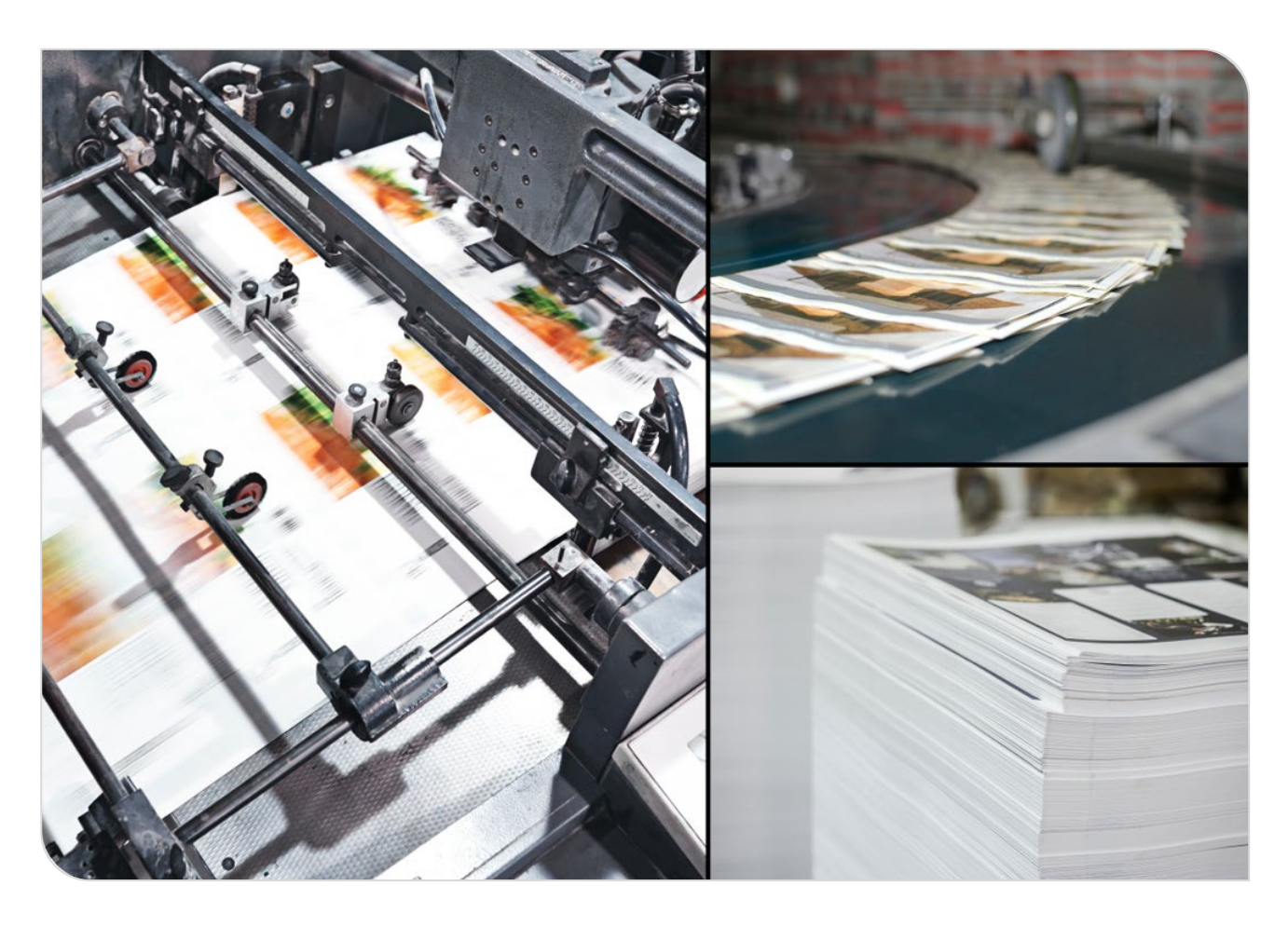
Version 6.11 • 17 March 2021 – 31 December 2027